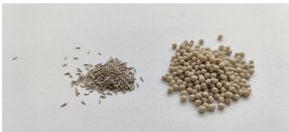
Figure 1. Lettuce seeds of Panukia F1 before (left) and after pelleting (right)

Lettuce seeds of the Panukia F1 hybrid (Daehnefeld, Syngenta, Egypt), which have not been pelleted in Serbia so far, were provided by the Grow Rasad DOO company (Irig, Republic of Serbia) (Fig. 1). Seed pelleting was done in the rotating drum Centricoater Model CC10 (Cimbria, Thisted, Denmark). A commercially available product Covercoat B101 (Kwizda Agro GmbH, Wien, Austria) was used as a pelleting mass. Commercial product Sodium Carboxymethyl Cellulose type WALOCEL™ CRT 1.000 PA, CAS No.9004-32-4, was used as a binding agent. It is a light yellow, odourless, tasteless, non-toxic, water-soluble powder with a pH-neutral reaction. Immediately before the pelleting process, a solution of a binding agent is prepared. A powder of a binding agent is firstly dissolved in water (100 g in 10 l) with stirring, and after 24 h additional dilution is performed (1/1, v/v). Dry seeds are poured into the rotating drum of the Centricoater, and a portion of the prepared solution of the binding material is added (100 ml per 1 kg of seeds) by spraying under pressure via a disc sprayer. The remaining part of the binding