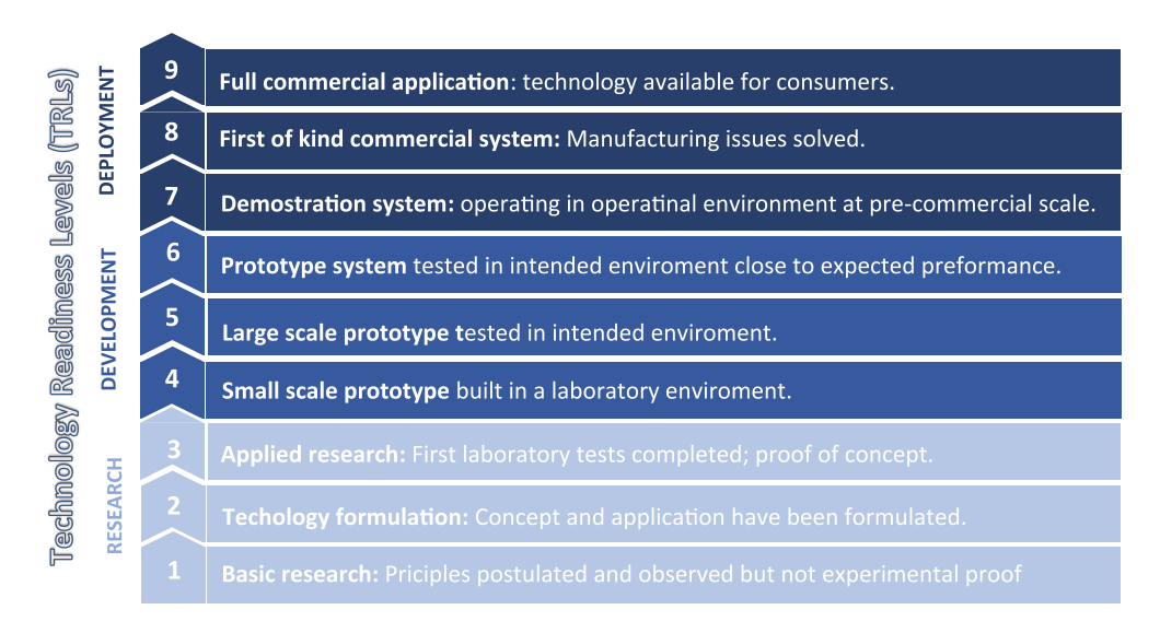
FIGURE 2 Standard technology readiness levels as defined by the European Commission.

ons) on Wiley Online Library for rules of use; OA articles are governed by the applicable Creative Commons I